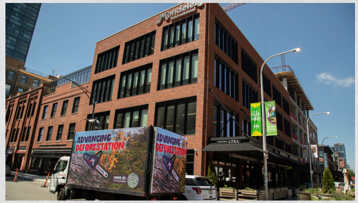
May 22, 2024: RAN and partners showed up at the Mondelez headquarters during their annual shareholders meeting to hold them accountable for Indigenous rights violations and rainforest destruction. Mondelez is one of the largest snack food companies in the world, and they continue to source palm oil from agribusinesses operating illegally in some of the planet’s most critical rainforest ecosystems.