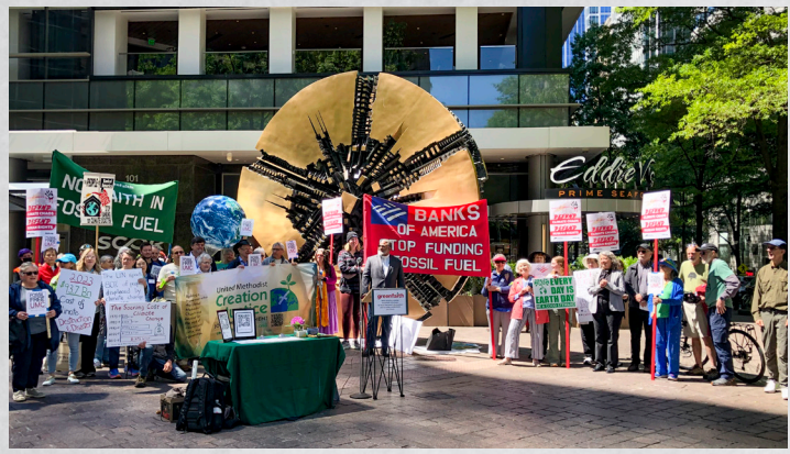
May 8, 2024: Along with partners, allies and activists, RAN took to the streets of Charlotte, North Carolina outside the Bank of America headquarters to call them out for their role in human rights and climate disasters — from their continued investment in the fossil fuel industry to funding the Mountain Valley Pipeline.