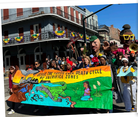
January 19, 2024: We joined Gulf Coast community members on the streets of New Orleans to protest the buildout of methane gas (liquefied “natural” gas) terminals in their backyards, while corporate executives gathered for the American Energy Summit.