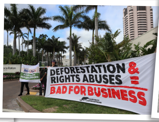
February 20, 2024: While the world’s leading investment institutions and consumer goods companies are gathered at The Boca Raton, a luxurious coastal resort, we showed up to warn investors to stay away from these companies! Many of them, like Procter & Gamble and Mondeléz International, are some of the biggest drivers of forest loss and community conflicts around the world.