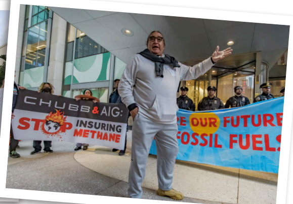
February 28, 2024: As part of the Insurance Global Week of Action, RAN, community leaders from the Gulf Coast, and a hundred activists showed up at the office of Chubb to demand an end to fossil fuel insurance.