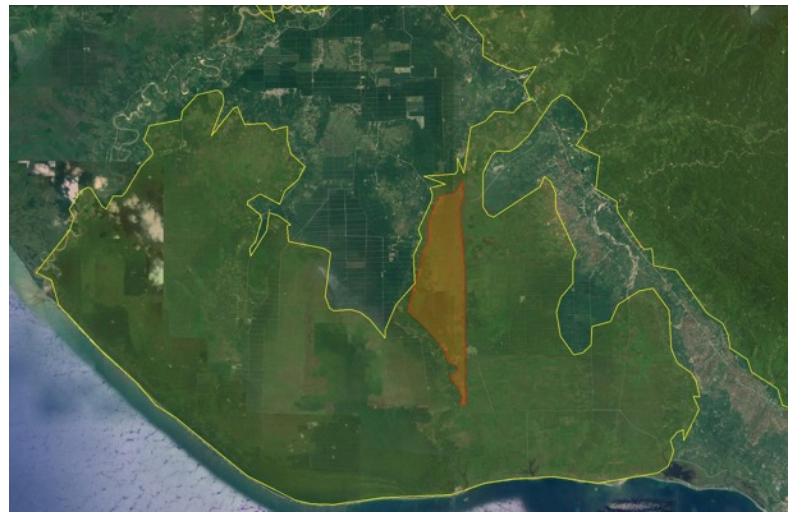
PT. DPL's concession (orange) shown in the Tripa peatland, inside the Leuser Ecosystem (yellow).

Indonesia's then-Ministry of Environment for illegally burning the forested peatland. PT. DPL was found guilty, ordered to pay a fine and its estate manager was sentenced to time in prison. PT. DPL is appealing the verdict. 3