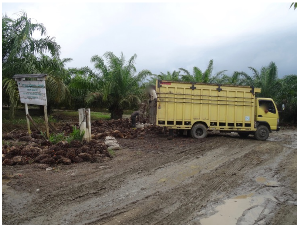
Palm oil fruit being loaded onto a truck next to PT. DPL sign. GPS: 3°54'27.16"N, 96°37'0.71"E