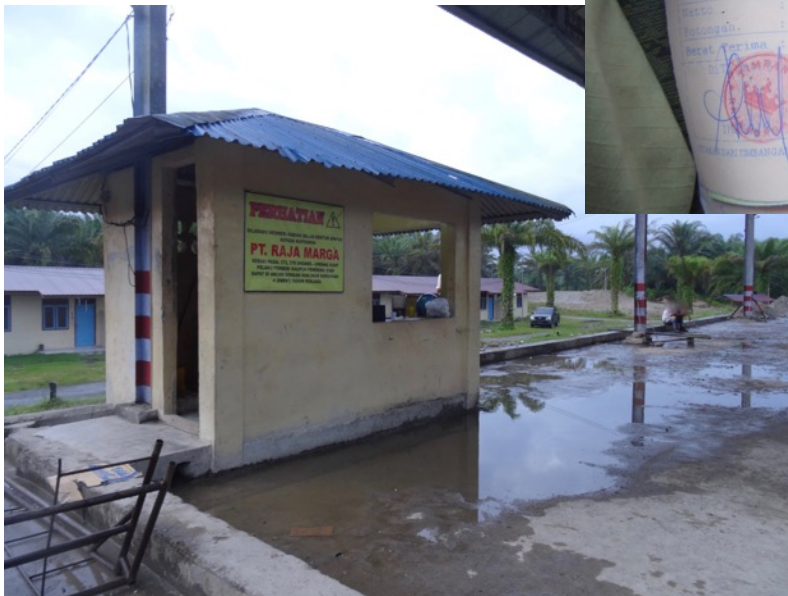
Sign at PT. Raja Marga mill.