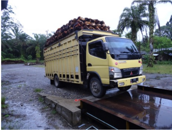
Truck arriving at the weighing station. GPS: 4°0'37.65"N, 96°36'0.75"E

Mill: PT. Raja Marga - The investigation tracked the truck containing the palm oil fresh fruit bunches approximately 20 kilometers from PT. DPL's concession to a weighing station. From the weighing station the same truck was tracked for less than five kilometers to the nearby crude palm oil mill owned by PT. Raja Marga. The connection between PT. Dua Perkasa Lestari and PT. Raja Marga is further proven through a number of documents including a weighing slip.