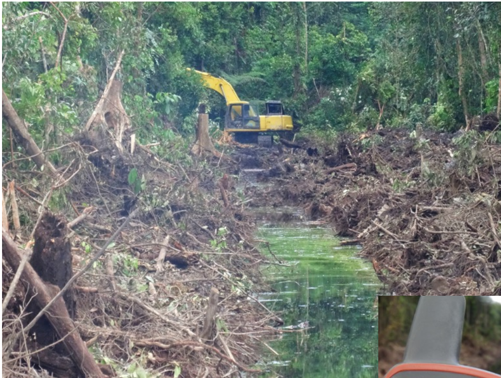
Peat drainage canal built by PT. DPL. GPS: 3°50'3.04"N, 96°35'45.58"E

GPS coordinates at drainage canal: 3°50'3.04"N, 96°35'45.58"E