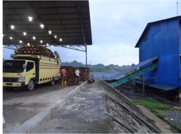
Truck arriving and unloading at PT Raja Marga. GPS: 3°59'7.73"N, 96°37'37.73"E

Weighing slip connecting PT. DPL and PT. Raja Marga