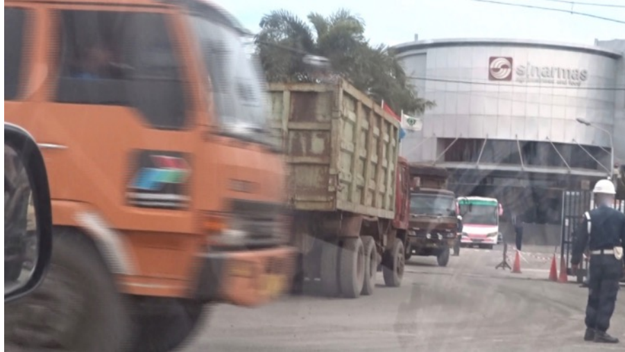
Golden Agri-Resources' Belawan Refinery and Kernel Crushing Plant. GPS: 3°46'42.99"N, 98°41'20.47"E

GAR has a crushing facility and refinery at the port and also states on its supplier list that it purchases crude palm oil and palm kernels from PT. Raja Marga. 7 GAR has not issued a public response since the release of RAN's latest report stating if it continues to source from PT. DPL via PT. Raja Marga or other mills in the region. As a matter of priority, GAR must stop sourcing from PT. Dua Perkasa Lestari.