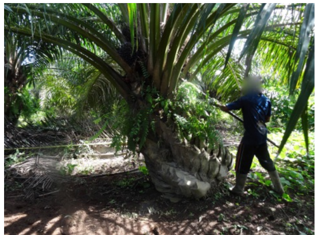
RIGHT: Palm oil fruit being harvested at PT. DPL. GPS: 3°54'20.76"N, 96°36'59.23"E

In order to identify the palm oil mill that continues to buy palm oil fruit from PT. DPL and processes it into crude palm oil (CPO), investigators observed the harvest, collection and loading of palm oil fruit within the PT. DPL concession.