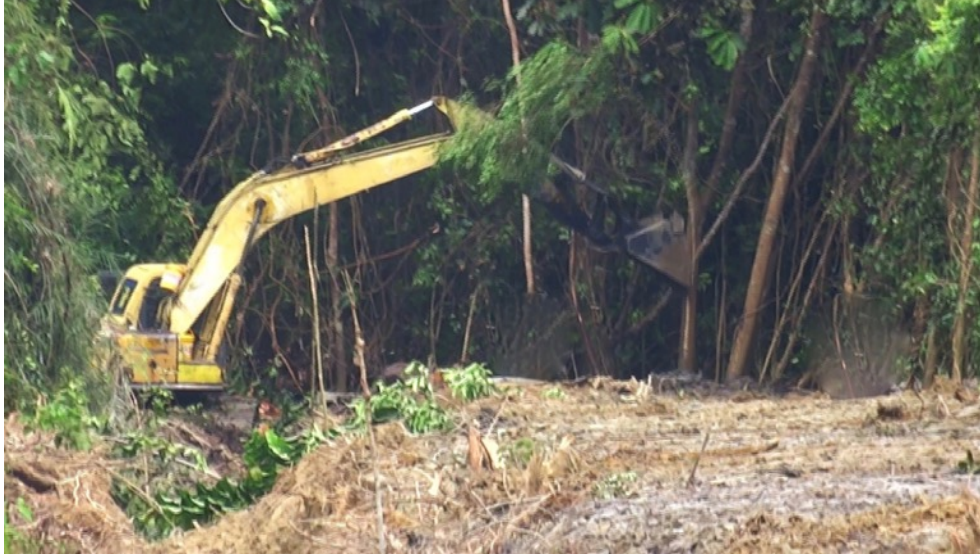
Excavator clearing trees and digging a drainage canal. GPS: 3°49'52.69"N, 96°35'57.01"E

In November 2016, RAN carried out a field investigation of PT. DPL and observed active forest clearing and digging for several peat drainage canals.