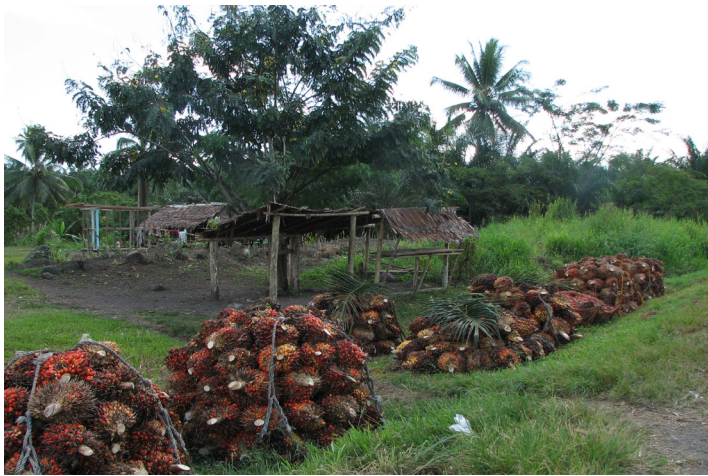
OIL PALM FRUITS GROWN BY SMALL SHAREHOLDERS AWAIT PICKUP TO BE TAKEN TO CARGILL'S HIGATURU MILL.